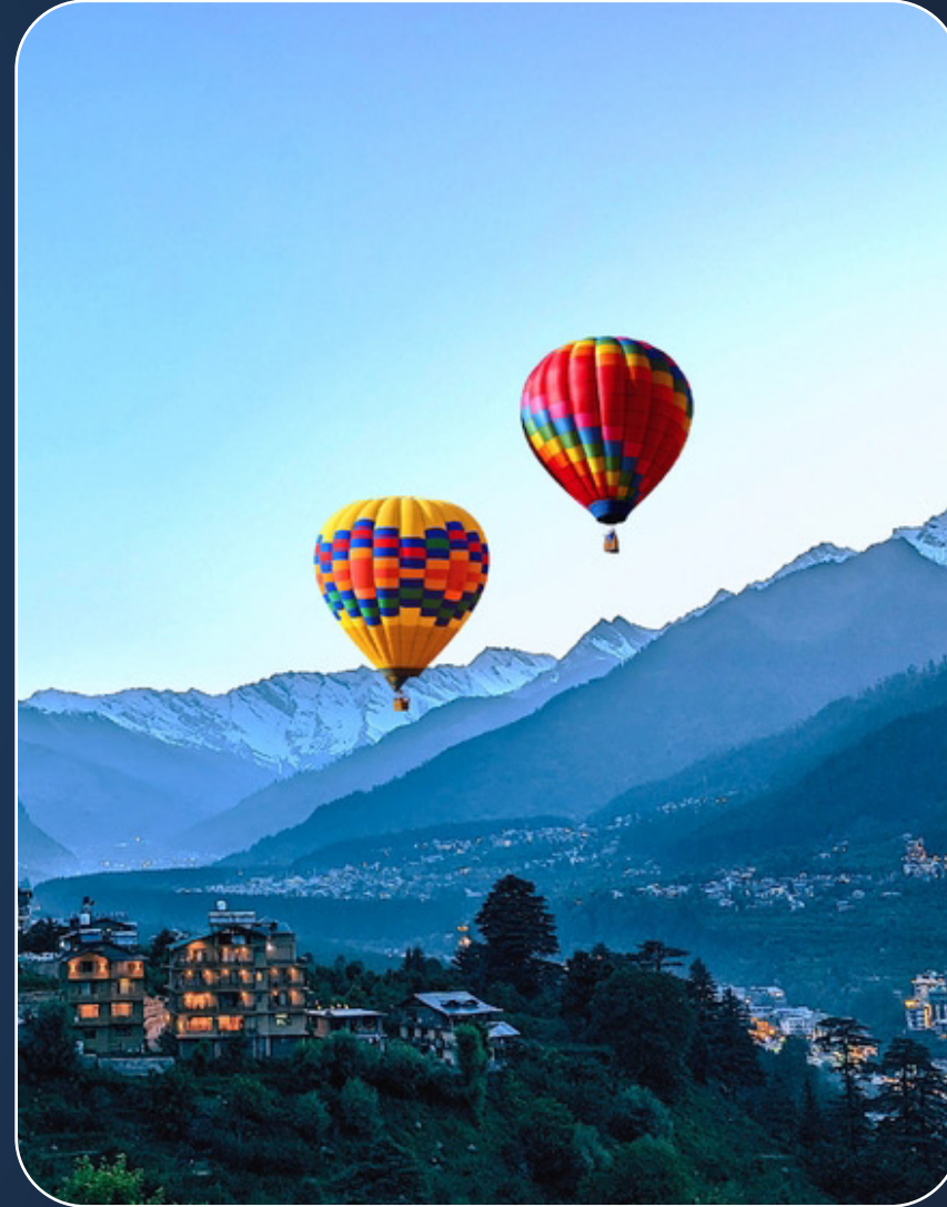
Manali Tour on 10 Member 10 Direct Total = 100