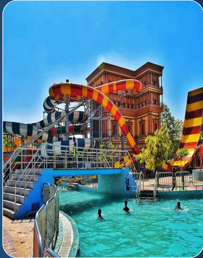
Blue World on 10 Direct