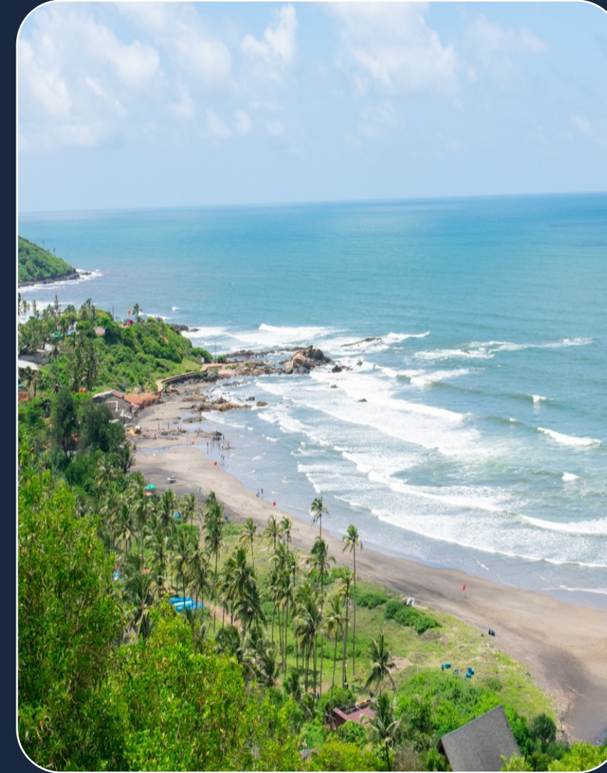
Goa Tour on 100 Member 10 Direct Total = 1000